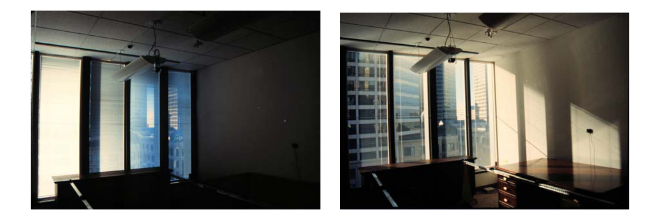
Figure 1: Smart controls on the automated blind systems (left photo) keep direct sun out of the space, reducing glare and cooling loads. The same hardware system with different control strategies (right photo) admits sunlight to offset heating loads but creates excessive glare.

permit better control of both energy use and comfort, assuming that the proper control strategies can be successfully developed, implemented and maintained. These systems are not commonly available in the U.S., nor are systems that further link to automated lighting controls. Beginning with "off the shelf" components we developed and tested these systems in two identical side by side test rooms in a southeast facing office building in Oakland, CA. (Figure 1) Not only were cooling and lighting energy savings achieved, and peak electrical benefits measured but the resultant automated systems were acceptable to occupants, in a limited occupancy study. Despite the success of the demonstration, the lack of a cost effective system delivered by a single vendor or groups of vendors continues to limit use of such systems.