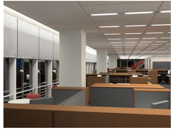
Figure 3: Initial RADIANCE simulations of the west façade of the New York Times building. Left: Without interior automated shading, the exterior ceramic rod shading system is insufficient to control glare on work surfaces. Right: A night view of a more refined image with actual furniture layout, electric lights on, with shades partially deployed.