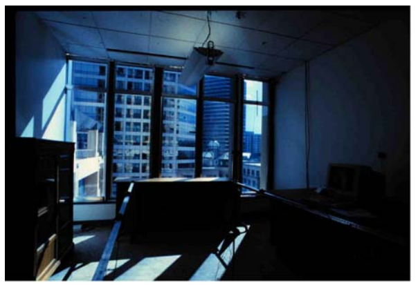
Figure 4: Electrochromic test rooms in Oakland, CA. The room at left is in a clear transmission state on an overcast morning; at right the sun has emerged and the window switches to its darkest state to control glare at the computer workstation.

Field tests in the Oakland building were limited to the orientation of the building and required that the electrochromic glazings be inserted inboard of the existing building glazing which could not be removed.