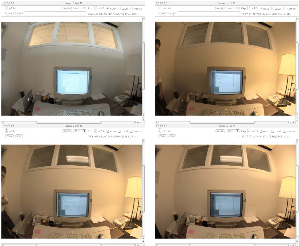
Figure 3. Four HDR images of workstation under four lighting conditions: Top Left: Ambient light only Top Right: Plus table lamp (uplight and downlight) Bottom Left: Overhead light plus table lamp (uplight and downlight) Bottom Right: Overhead light plus table lamp (uplight only)

These are screen captures taken from Photosphere with the luminance of the computer screen selected and measured.