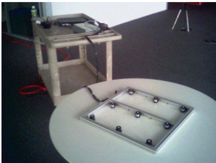
Figure 1. Photometric measurement apparatus for measuring and recording the average illuminance at the work surface. The Campbell Scientific data acquisition system and laptop are shown on cart in the background.