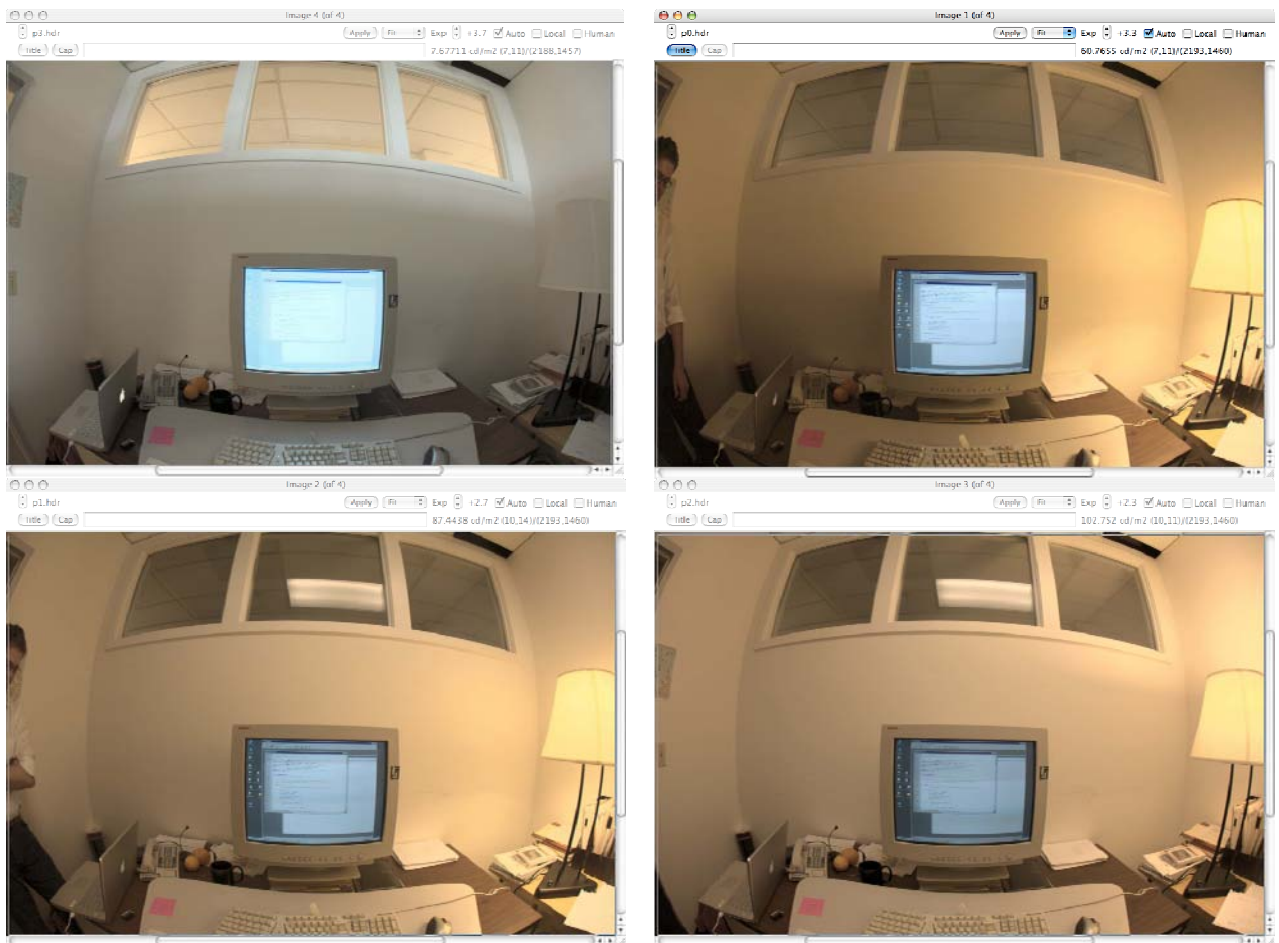
Figure 1. Four HDR images of workstation under four lighting conditions: Top Left: Ambient light only Top Right: Plus table lamp (uplight and downlight) Bottom Left: Overhead light plus table lamp (uplight and downlight) Bottom Right: Overhead light plus table lamp (uplight only)

The following images show the same four HDR images processed through Photosphere to extract luminance of 1) the whole image, 2) the keyboard only and 3) the computer screen only. The graph shows all these luminance statistics for each of the lighting conditions. Note that this is a very useful way to compare lighting conditions. The keyboard luminance under the condition (3) is 67.8 while the keyboard luminance under (4) is 89.5. This would allow the verifier to quantify in detail the difference in photometric distribution as a result of, for example, overridden roller shades.